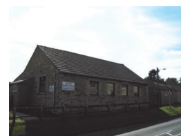
Swinton Reading Room And Community Hall