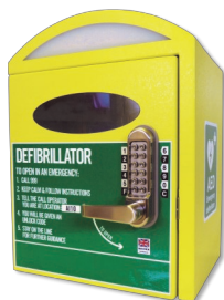
DeFibSafe Wall Mounted Cabinet

The External housing is a DeFibSafe Wall Mounted Cabinet, which is secured to an outside wall.