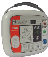
Wel Medical iPad SP1