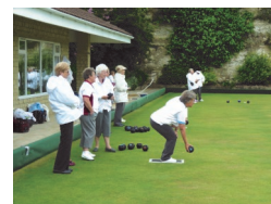
Top Ten Match

For More Information contact Matt Fenwick 01653 694640