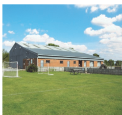
BSA Sports Centre