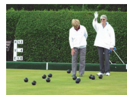
Top Ten Match